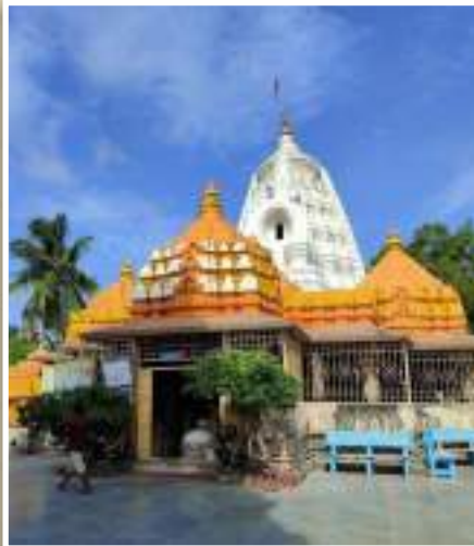
Sri Neelakanteshwara Temple