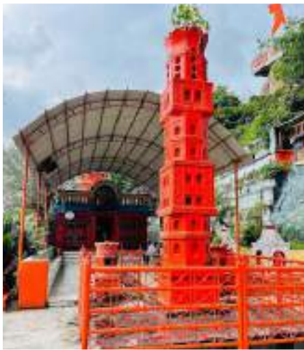
Sarangpur Hanuman Temple