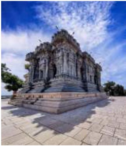
Dichpally Ramalayam Temple